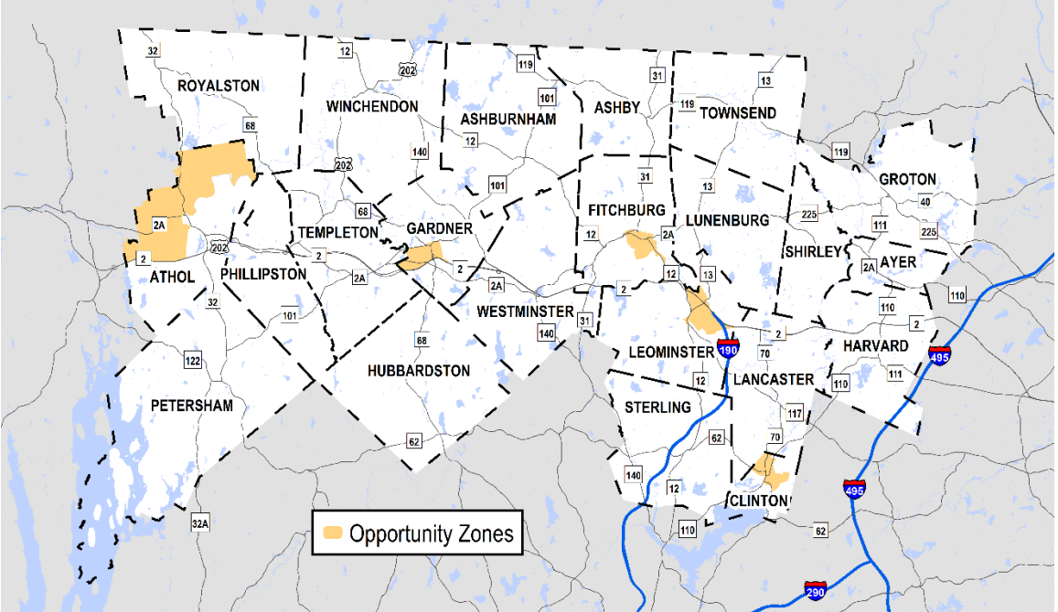
Figure 4-47 - MRCEDS: Federal Opportunity Zones

The Montachusett Region Comprehensive Economic Development Strategy (MRCEDS) provides a description of the federal Opportunity Zone program and the Opportunity Zones that are within the Montachusett Region. Opportunity Zones are census tracts generally composed of economically distressed areas. Ten census tracts were approved within five communities in the Region. The Opportunity Zones are distributed evenly (two each) among the following communities – Athol, Clinton, Fitchburg, Gardner, and Leominster (Figure 4-47).