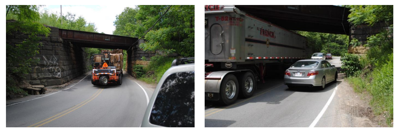
Figure 4-46 Route 31 Railroad Bridge in Fitchburg