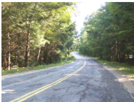
Route 62 in Hubbardston, MA