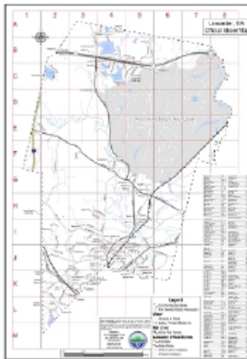
Lancaster Street Map