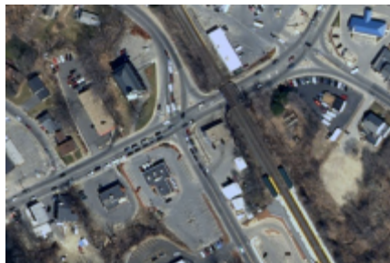
Route 13 in Leominster, MA